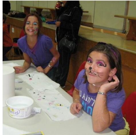
Face painters !