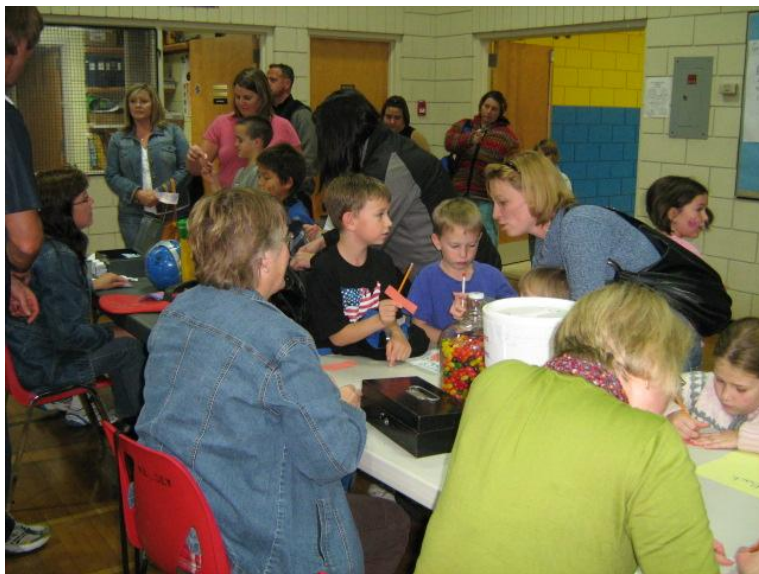
We had activities in the gym with the Blizzard players and a jellybean guessing contest.